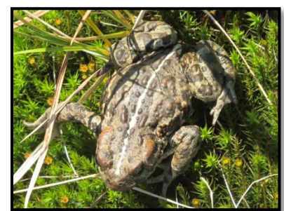
Boreal Toad at Twin Lakes, 2014