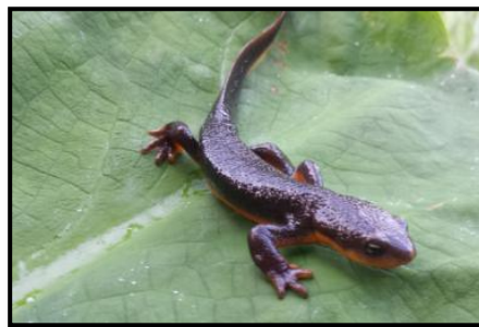
Rough-skinned Newt at Paradise Slough, 2013