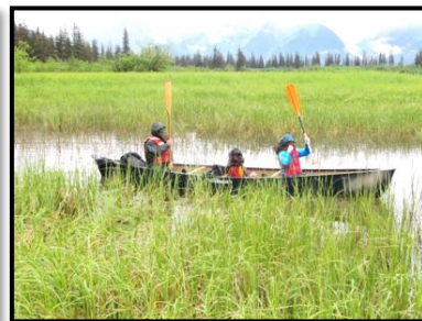
Camp'Phibian 2014 Active sampling with Wrangell Girl Scout Troop # 4156 @ Twin Lakes