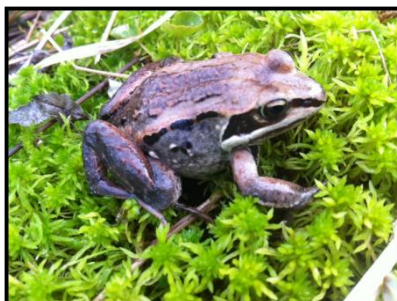
Wood Frog at Farm Island, 2012