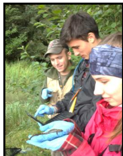
Service-Learning Program 2014 Active sampling with Petersburg Advanced Placement Biology Class @ Cheliped Bay & Mallard Slough